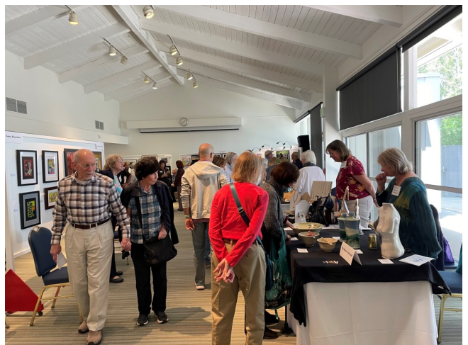
Guests were able to stroll through the Faculty Club's Morrison Room and patio to view all the various artwork.